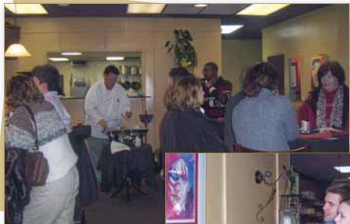
Above: Capitol Café serves a delicious sample of their shrimp and grits entree.