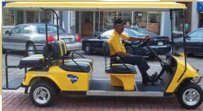
Left: CCP offers a hospitality shuttle service Monday through Saturday from 11 am to 11 pm, and Sunday from 9 am to 4 pm.